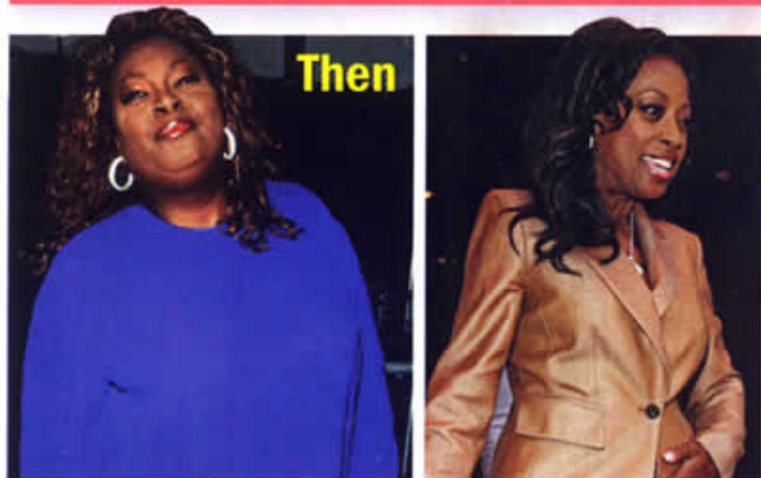
STAR JONES REYNOLDS The former View host admitted her dramatic weight loss is due to medical intervention — could that have included a lipo touch-up?