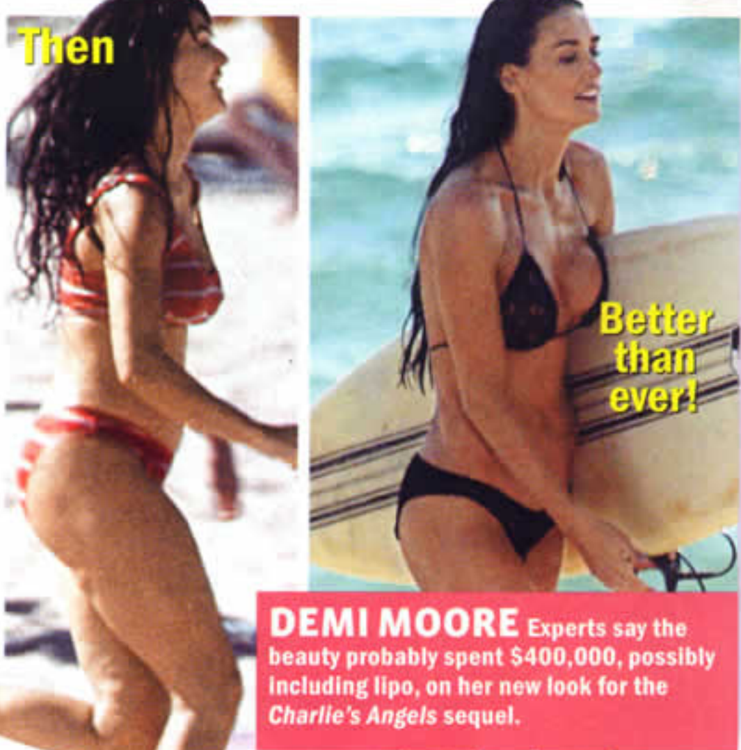
DEMI MOORE Experts say the beauty probably spent $400,000, possibly including lipo, on her new look for the Charlie's Angels sequel.